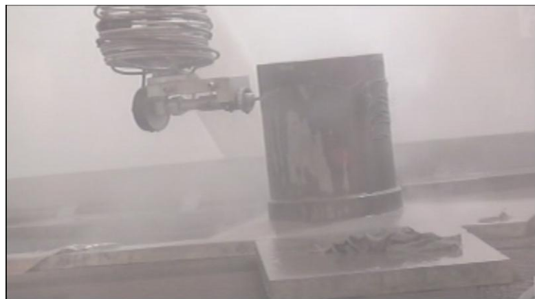
End-effector of water-jet tooled robot-cell from Flow Automation

This case study was prepared by In-House Solutions, the North American distributor of Robotmaster and the Canadian Distributor of Mastercam CAD/CAM Systems. www.inhousesolutions.com